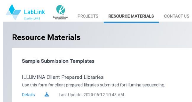
RESOURCE MATERIAL tab